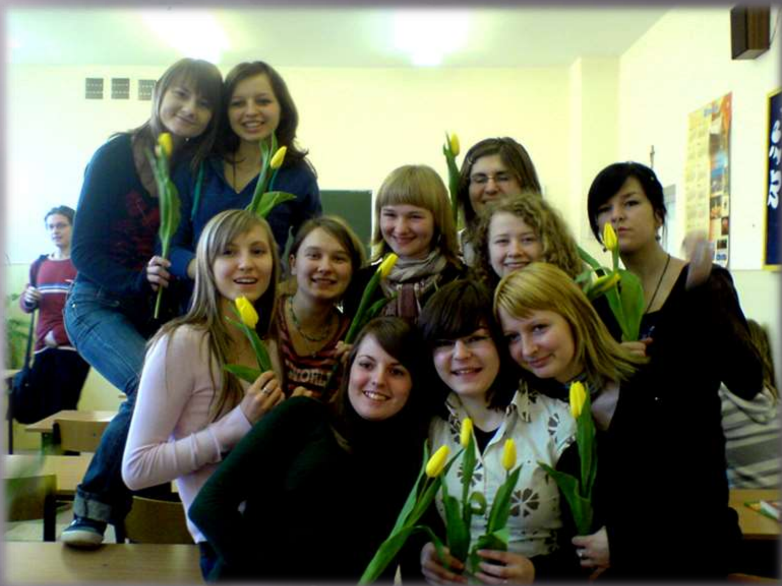
Celebrating Women's Day – March 8th