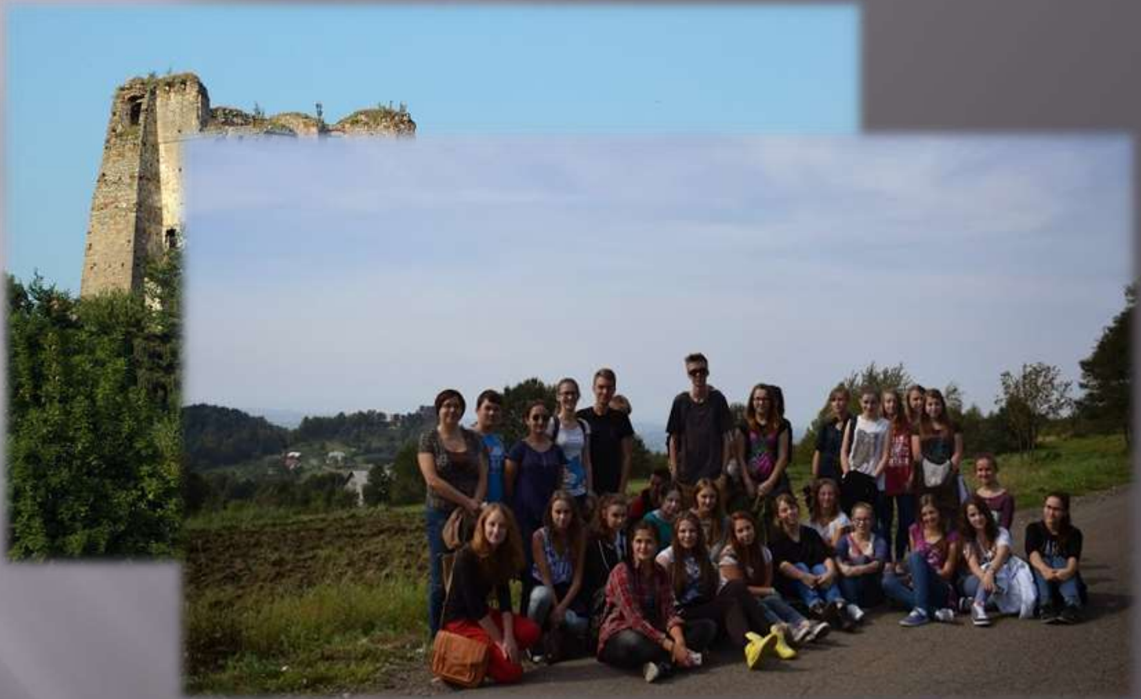
The Kamieniec Castle in Odrzykoń