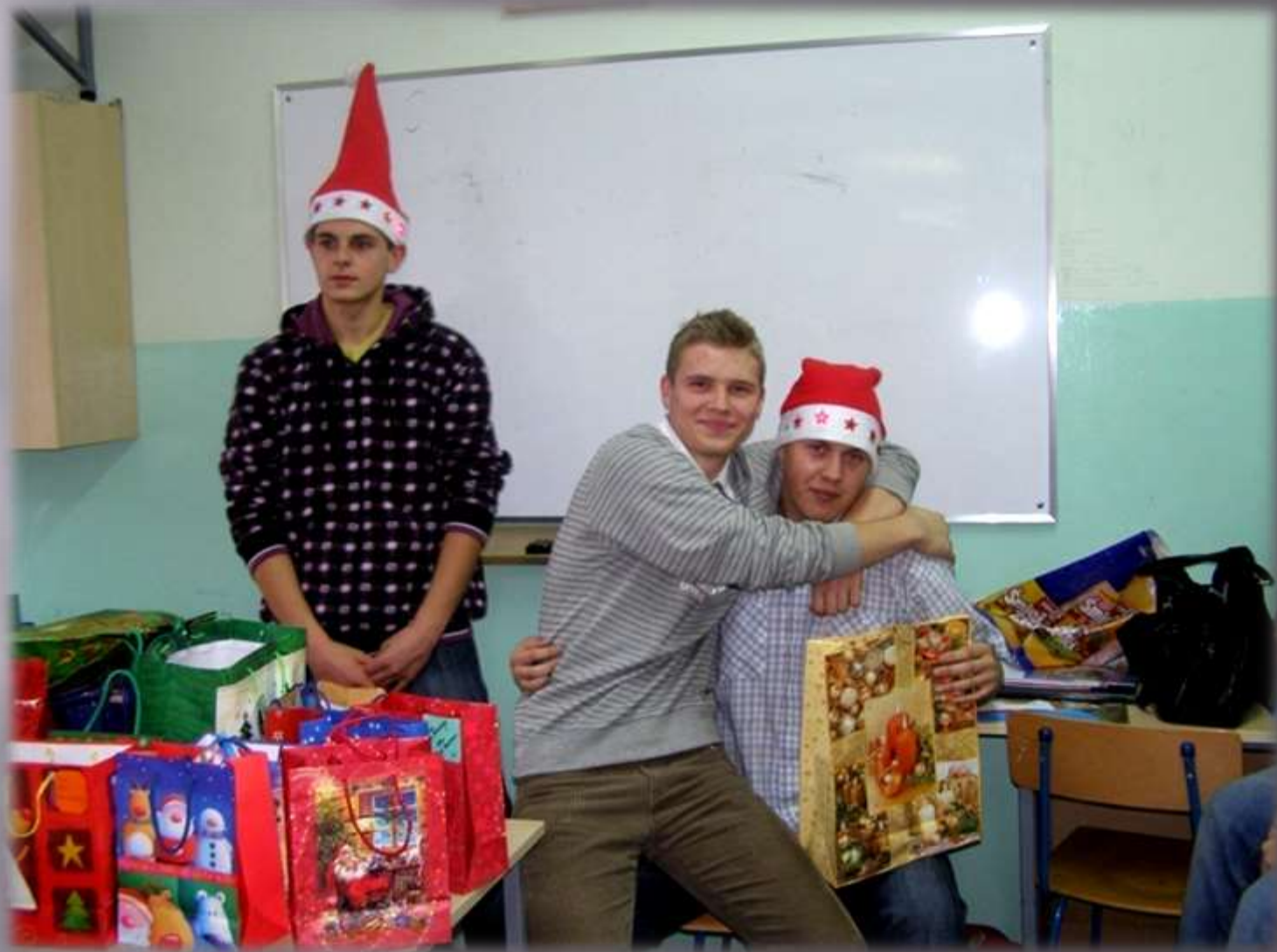
Getting presents from Santa Claus – Dec. 6th